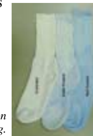
The sock on the right is well treated; the sock on the left is untreated according to the BPB testing.

Yes. A simple method of detection is available to demonstrate the presence or absence of the active ÆGIS Microbe Shield treatment. Bromophenol Blue (BPB) stain testing of the treated substrate clearly shows the presence of the ÆGIS Microbe Shield in a matter of minutes, visible by the blue dye.